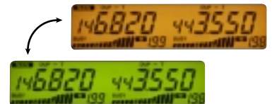
Selectable Green and Amber Display.