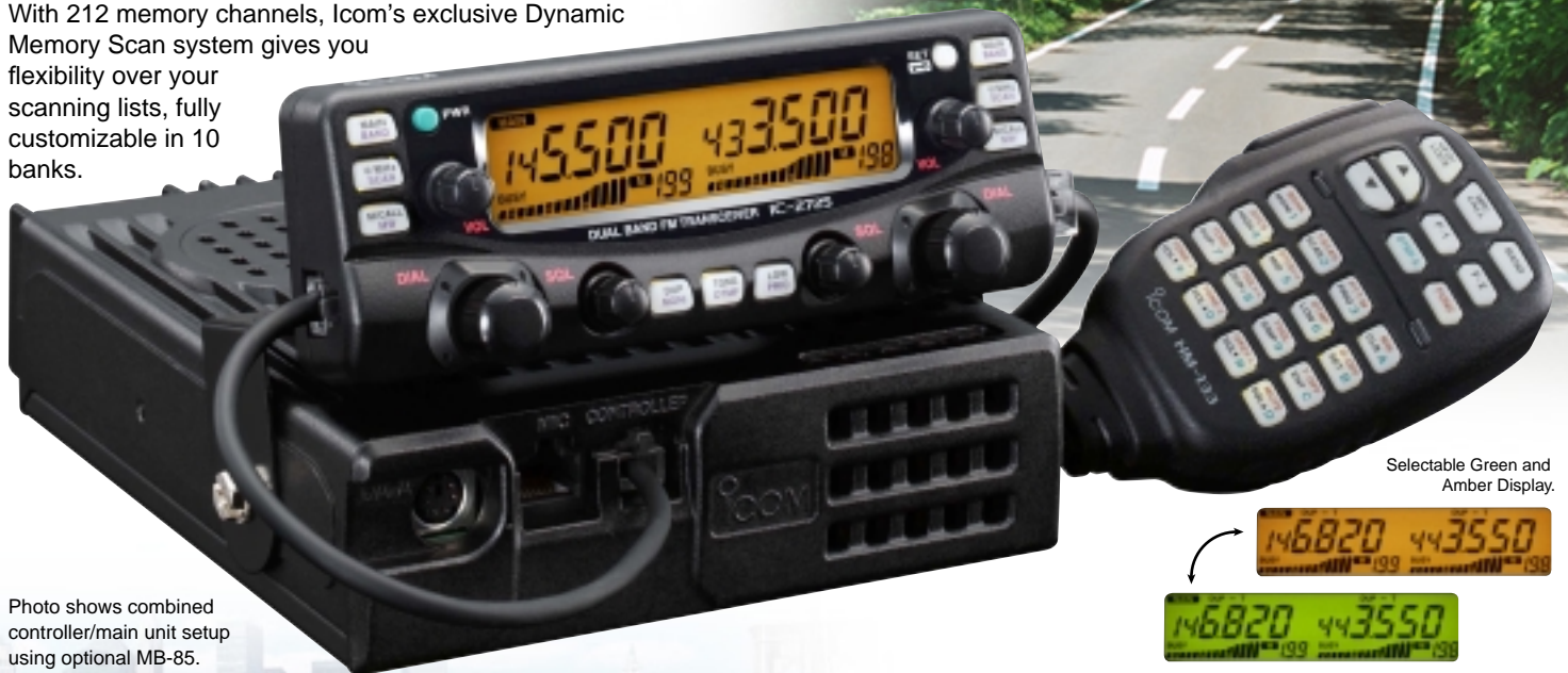
Photo shows combined controller/main unit setup using optional MB-85.

With 212 memory channels, Icom's exclusive Dynamic Memory Scan system gives you flexibility over your scanning lists, fully customizable in 10 banks.